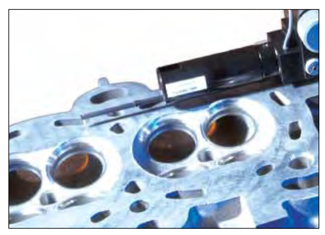
high resolution skidless pick-up is necessary for straightness and waviness measurements