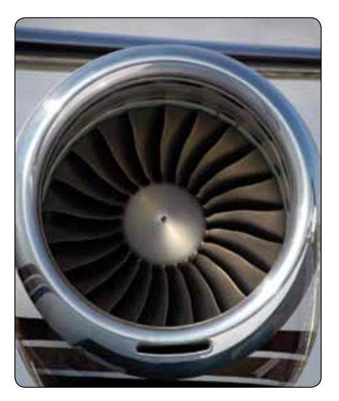
Small jet and turbine engine components

The Talyrond 565 and 585XL systems come with a frictionless air bearing spindle with high load capacity and excellent spindle stiffness. Large diameter bearings can be measured to a high degree of accuracy and with a high degree of resolution thanks to the massive 72,000 data point resolution of the systems high precision encoder. Added to the system's roundness/flatness capability each XL instrument comes with Harmonic and Velocity analysis software making it a powerful tool for the analysis of bearing surfaces.