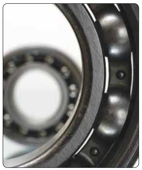
Large diameter high precision bearings

As well as non-symmetrical components these roundness systems can measure crankshafts, pistons, valves and cylinder liners making it the most versatile roundness system on the market.